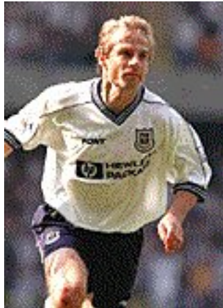
Figure 1: A very fine footballer